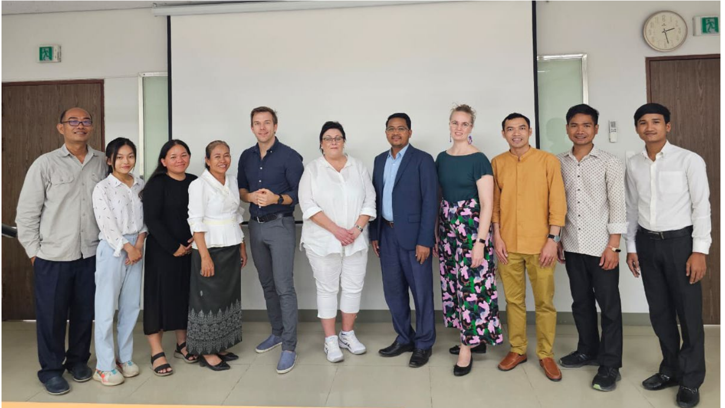
WP2 training days in Cambodia, January 2024

Project phases and milestones of WP2 involved several key phases. Data management included creating a comprehensive plan to handle, transfer, and ethically manage data. The focus groups methodology involved developing protocols, checklists, and questions for effective focus group interviews, addressing challenges, and proposing solutions. Content analysis was conducted through thematic analysis, including necessary translations, to consolidate insights.