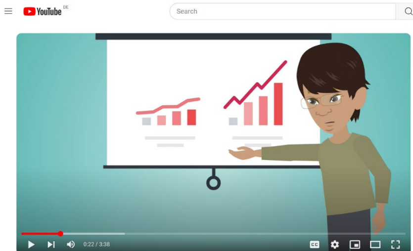
First animation video of MentalHigh MoodCare

This internet-delivered, multimedia, interactive, self-help program includes 8 modules oriented to learn and practice different psychological strategies. This program was developed by group Labpsitec, from Universitat Jaume I, and has been validated and used with different populations.