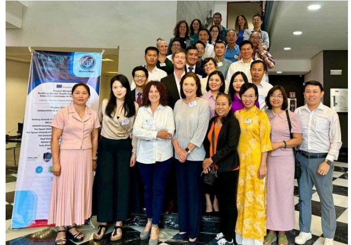
MentalHigh Consortium in Valencia, June 2024

Presentations were made on the progress of each of the work packages. Topics such as future scientific publications, the focus group interviews and their analysis, and the development of the digital intervention 'MoodCare and Shining mind app' were discussed.